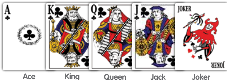
Ace King Queen Jack Joker

Here are some of the most important cards in a deck of cards (the cards with a rank):